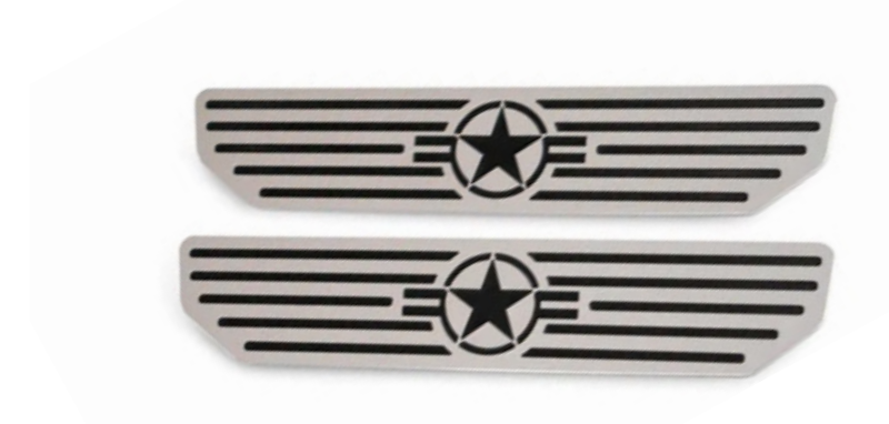
\begin{array}{c|c} \text{STEP 1} & \text{Peel back the plastic on the} \\ \text{DV8 door sill to reveal the adhesive.} \end{array}

Begin by unpacking all items and inspecting for missing pieces or damage. If you have any concerns, please contact the company the product was purchased from. Extra hardware may be included with the product.