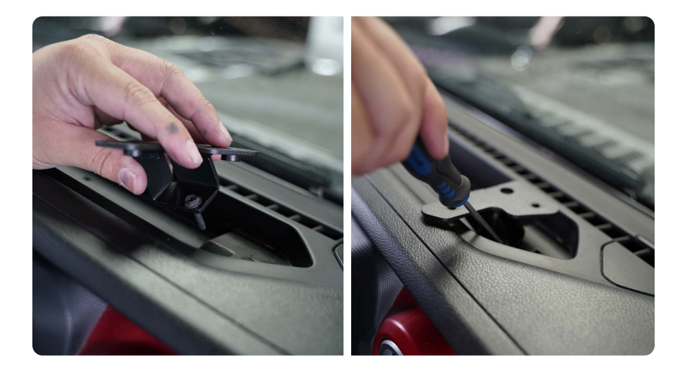
STEP 3 | Using the factory screws, install the two brackets provided. Take note of the orientation of the brackets.