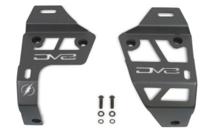
STEP 1 | Mount the Pod lights to the DV8 A- Pillar Dual Pod Mount, using the hardware provided with light kit.