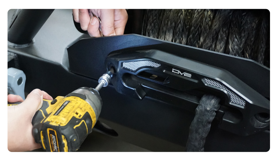
STEP 6 | Reinstall winch cable shackle hook using snap ring pliers.