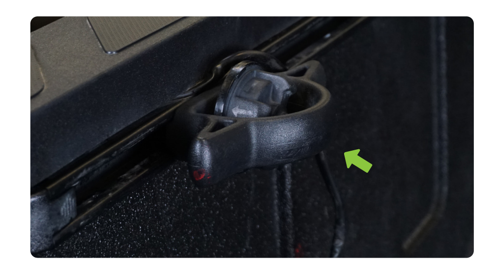
STEP 2 \mid Twist counter clockwise and pull cleat out of bed rail.

If the vehicle is not equipped with bed rails, skip to step 5.