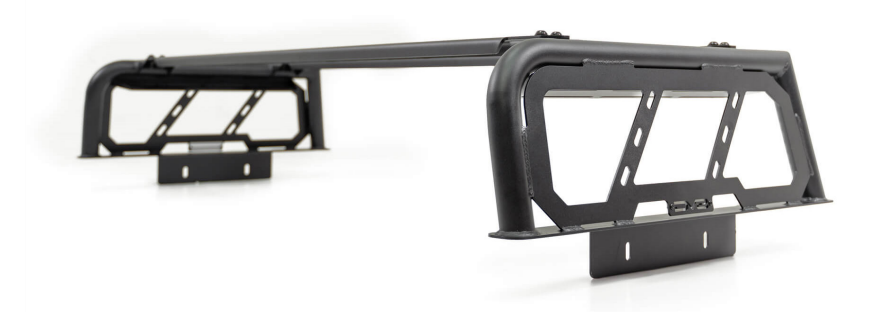
Rear Bed-Rack Section