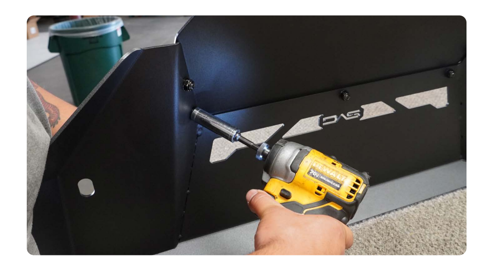
STEP 7 | With assistance loosely secure the skid plate using the provided M10 hardware.