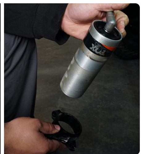
STEP 3 | Remove the lower frame cap using a 16mm socket to remove both factory bolts.