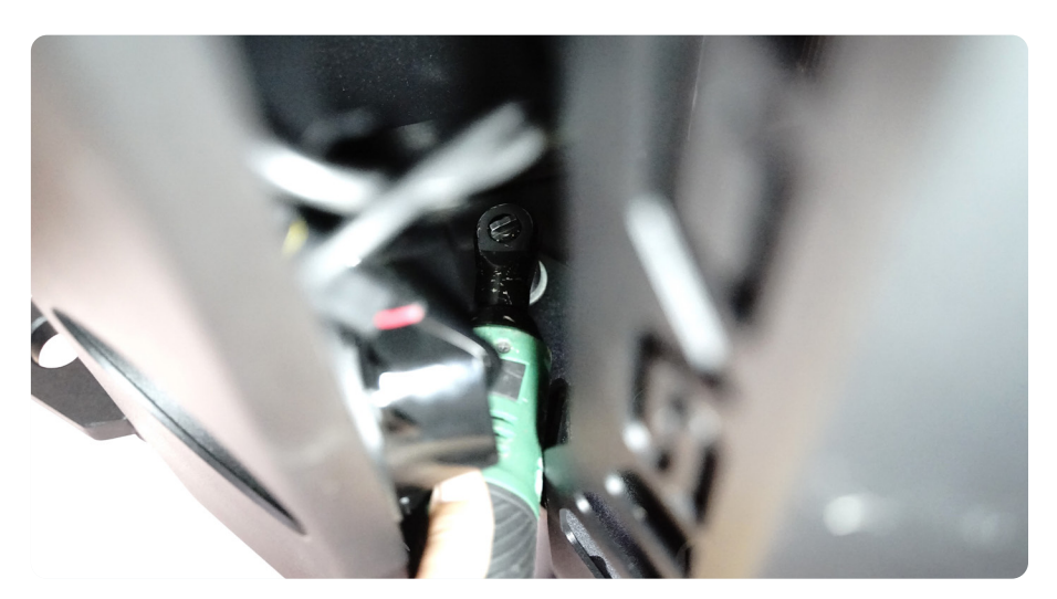
STEP 9 | Route the shock reservoir behind the frame into the reservoir clamp previously installed onto the skid plate.