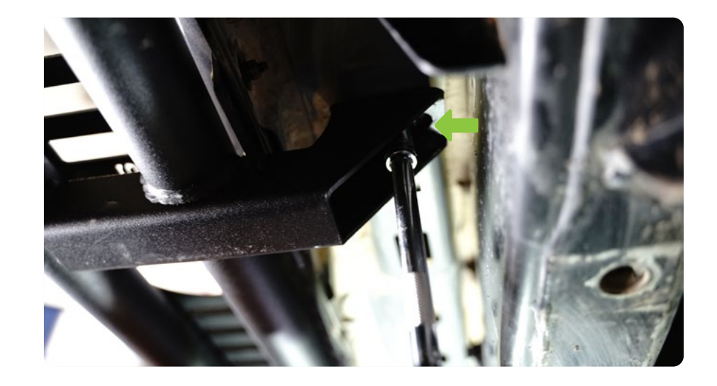
STEP 5 | Congrats! You are finished with the install of the 18+ JL Wrangler Step Sliders!

Double check fitment and all hardware is secure.